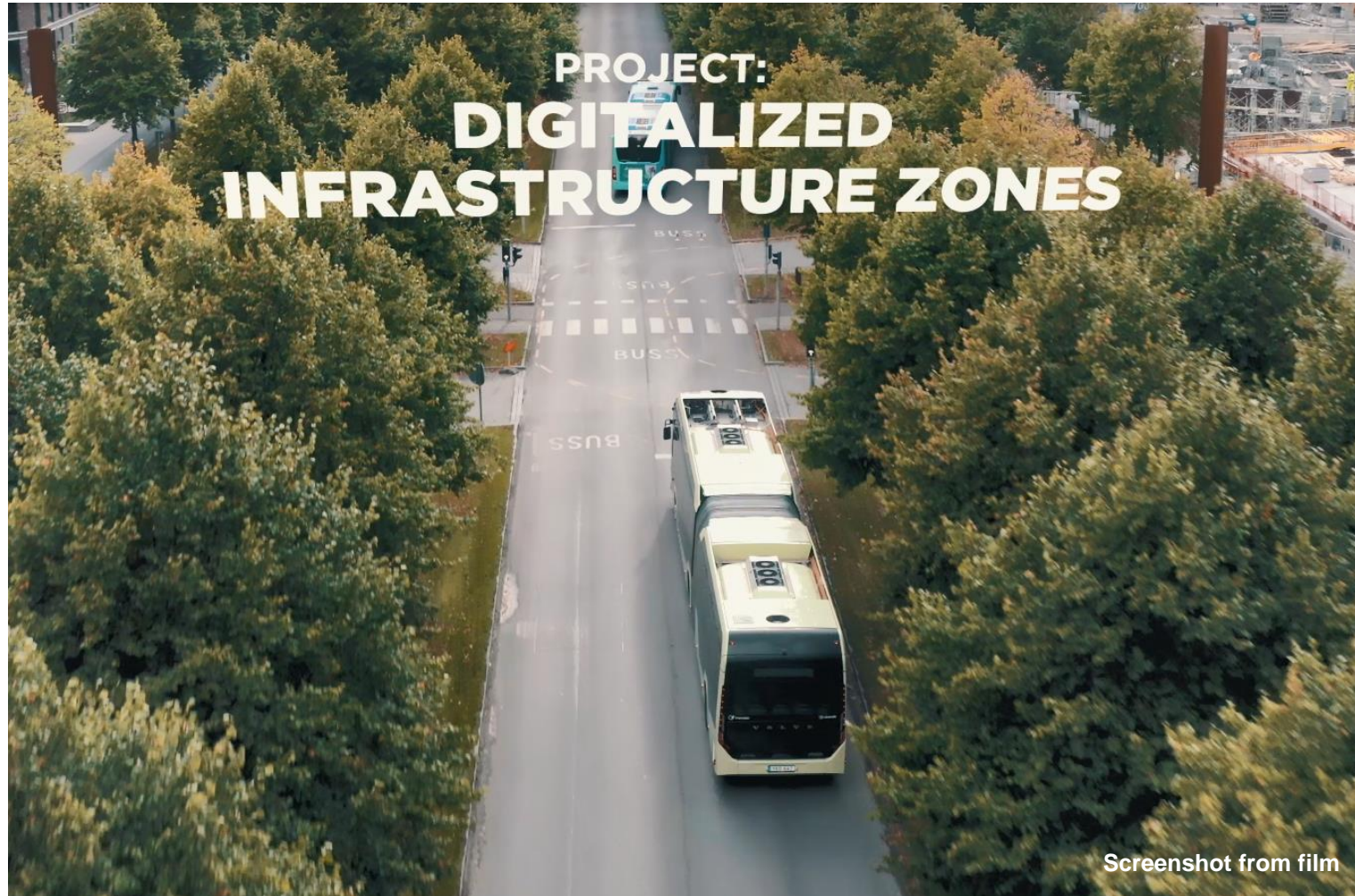
Geofencing tests in Gothenburg 2021